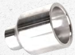
PGDMRDTSX TENT STAKE DRIVER SLEEVE